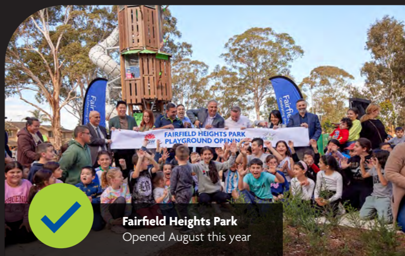
Fairfield Heights Park Opened August this year