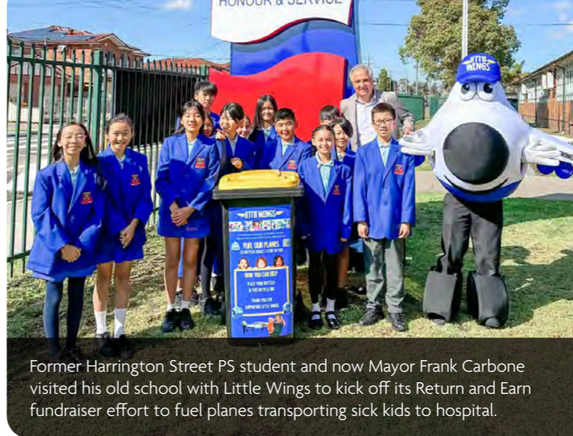
Former Harrington Street PS student and now Mayor Frank Carbone visited his old school with Little Wings to kick off its Return and Earn fundraiser effort to fuel planes transporting sick kids to hospital.