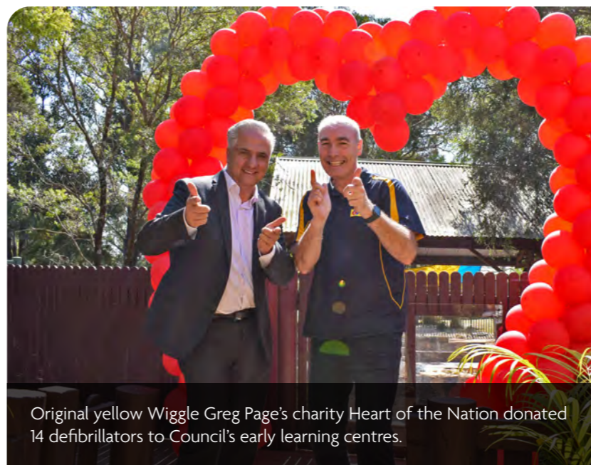
Original yellow Wiggle Greg Page's charity Heart of the Nation donated 14 defibrillators to Council's early learning centres.