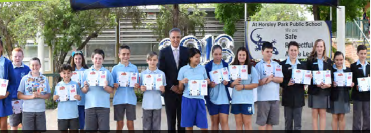
Mayor Frank Carbone will give away 6,000 free Aquatopia passes to more than 3,000 Year 6 students to mark their graduation.