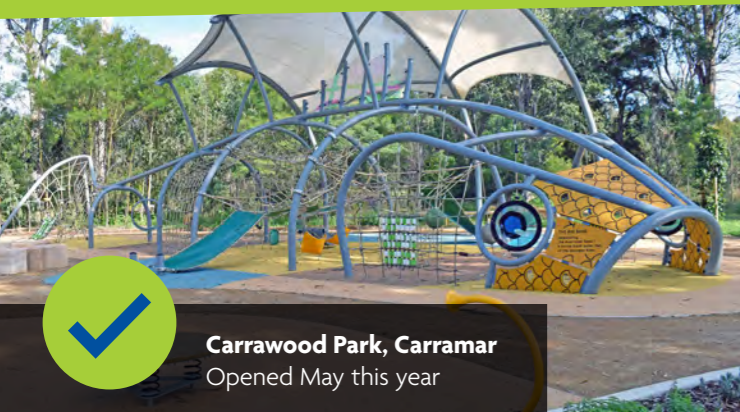
Carrwood Park, Carramar Opened May this year