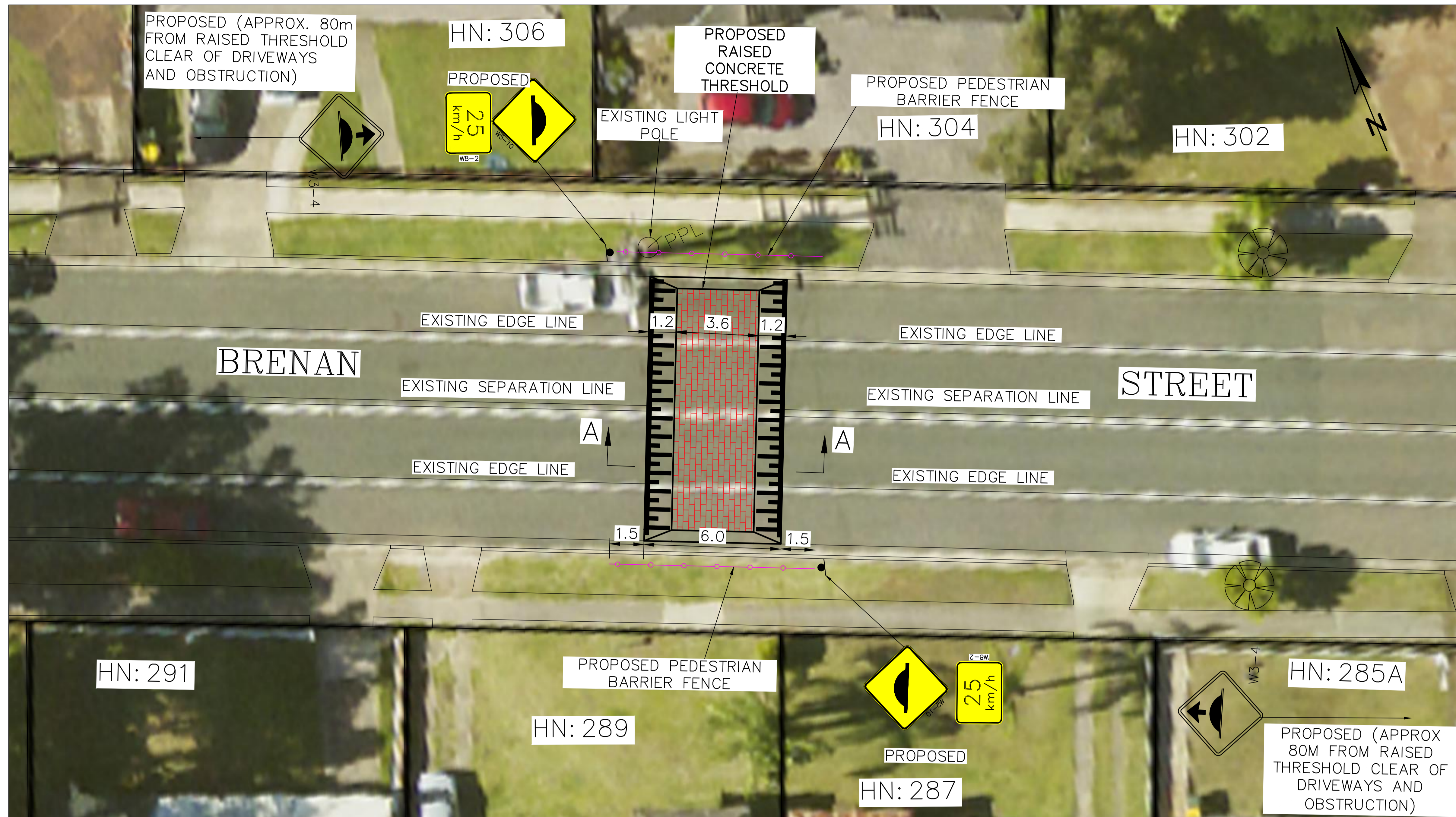
CONCEPT PLAN 1 SCALE: 1:100 @A1